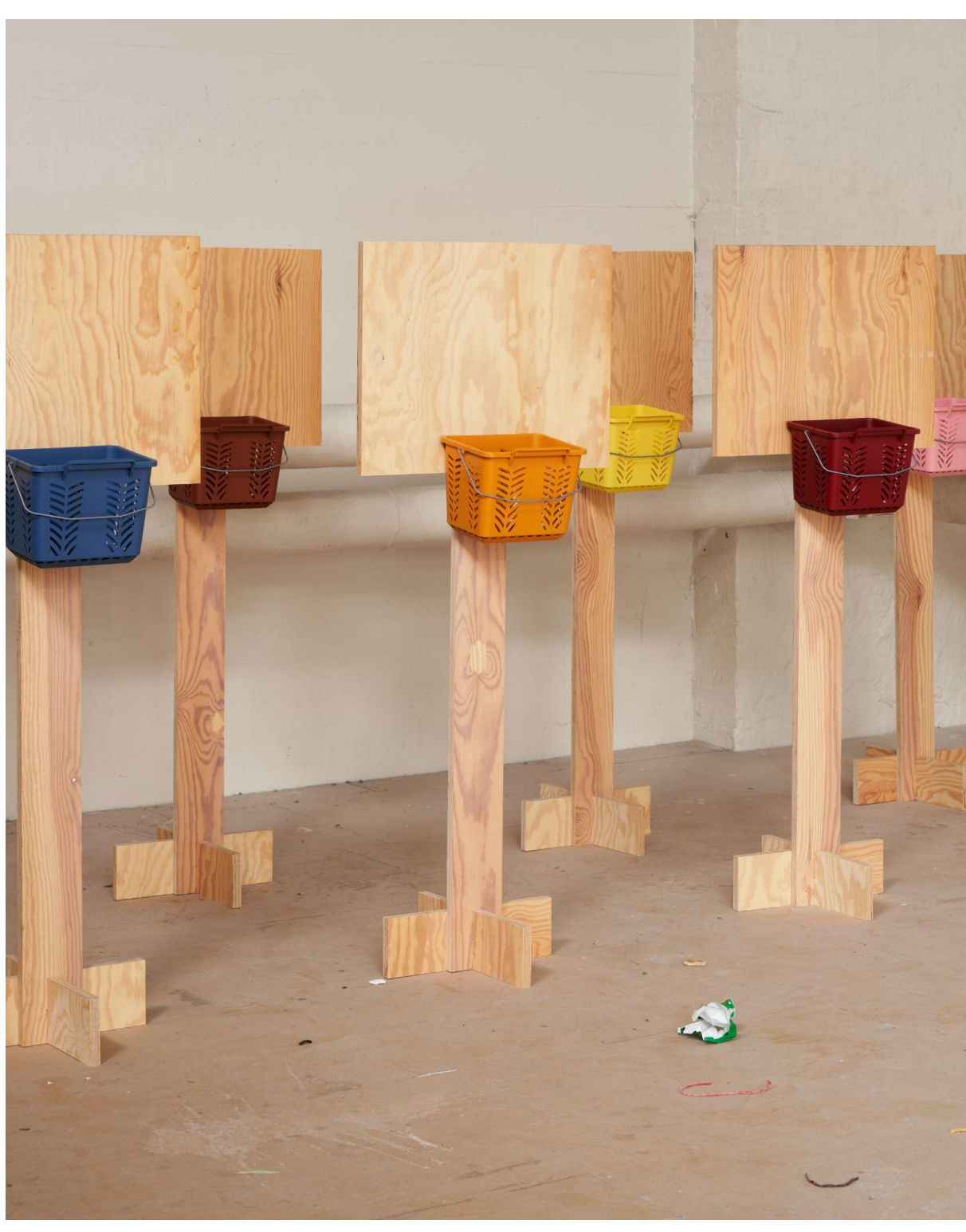
Hallen, 2024. Installation view.