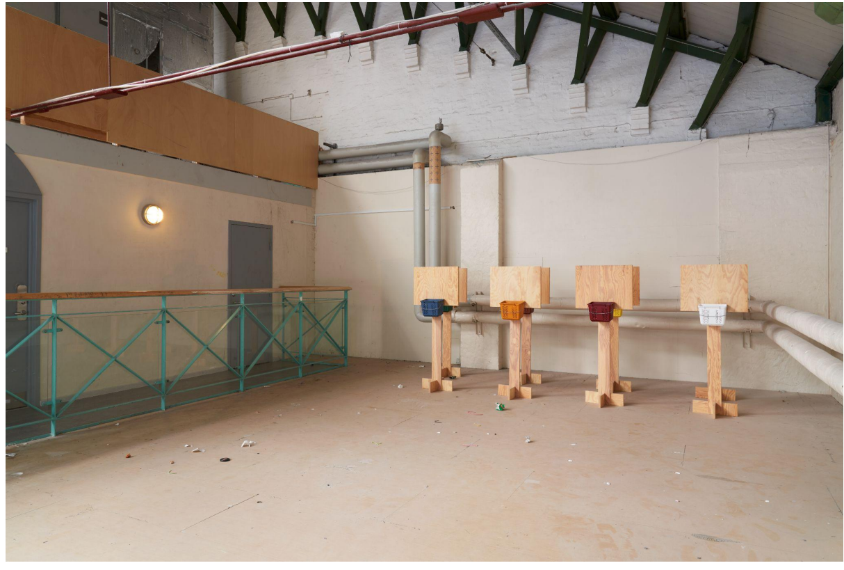
Hallen, 2024. Installation view.