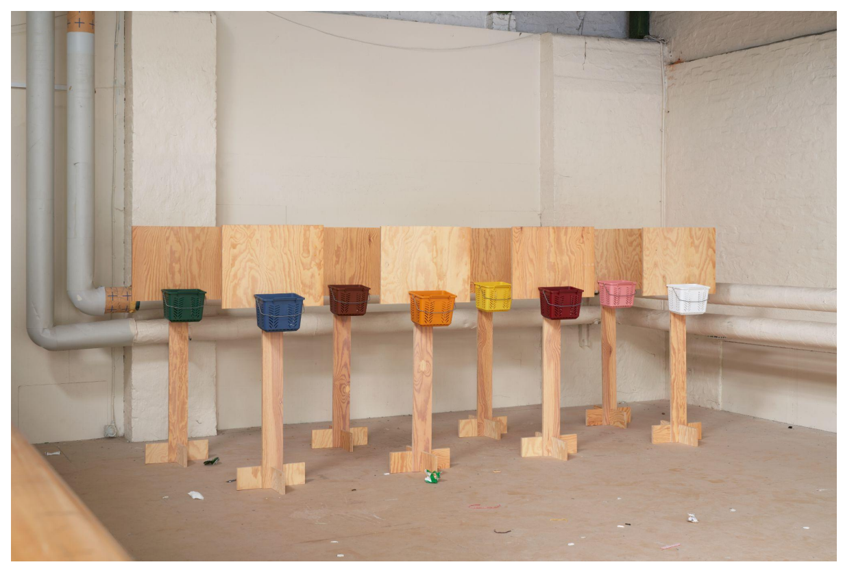
Hallen, 2024. Installation view.