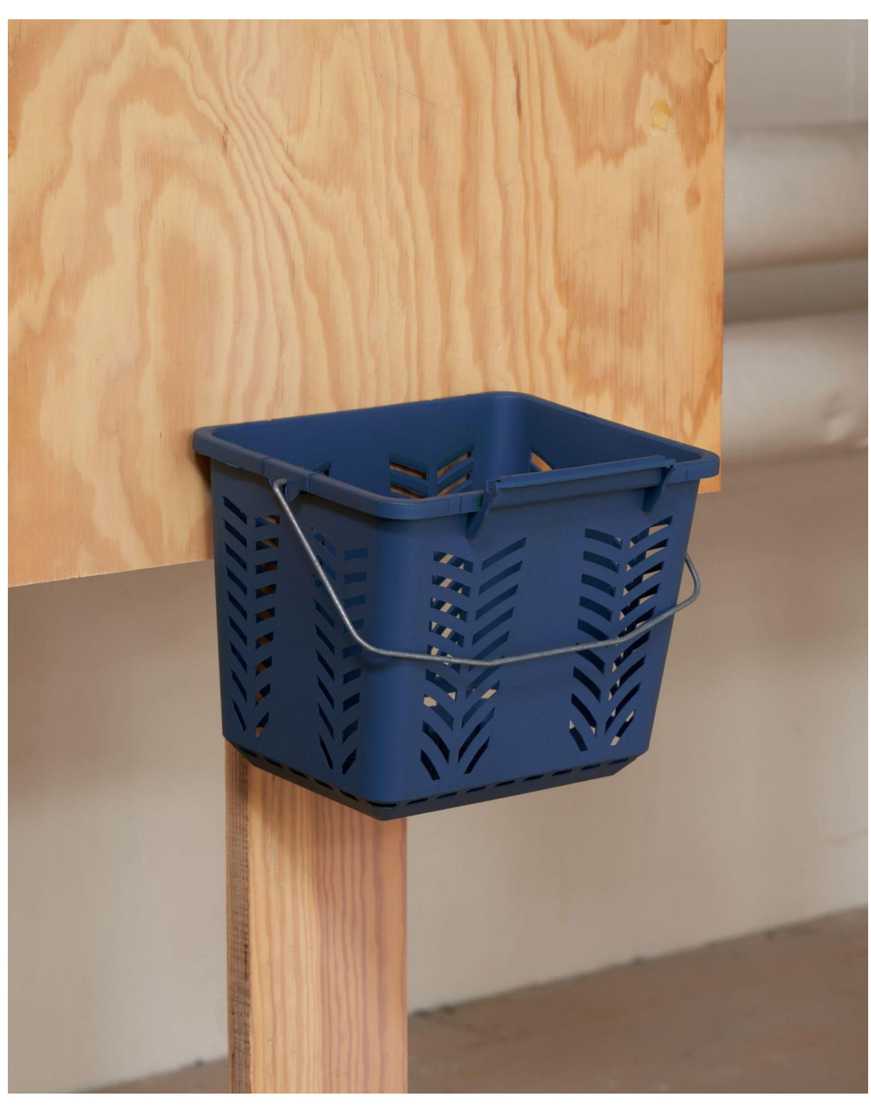
Hallen, 2024. (Detail)