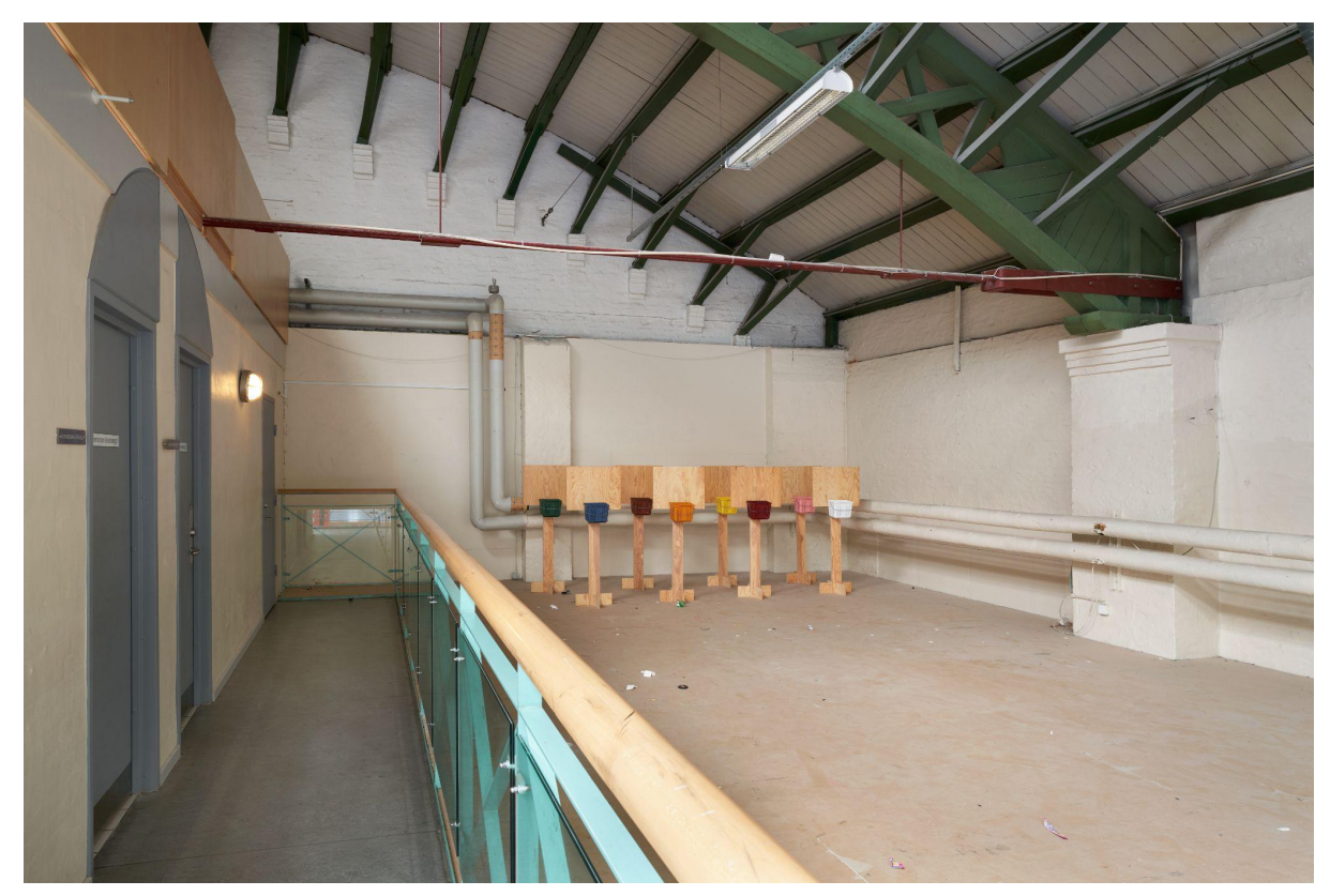
Hallen, 2024. Installation view.