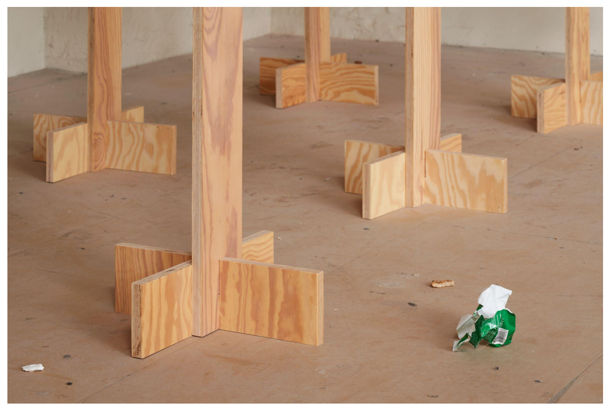
Hallen, 2024. (Detail)