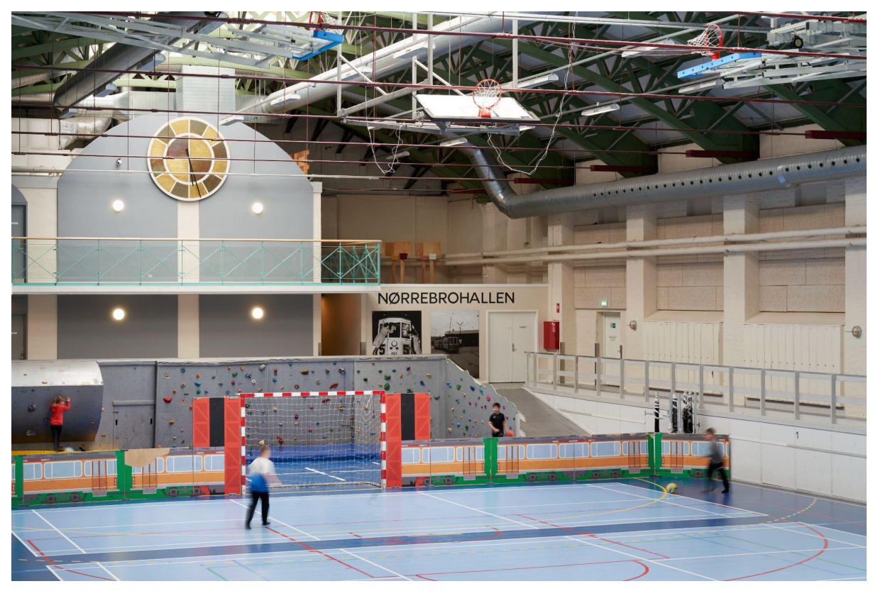
Hallen, 2024. Installation view.