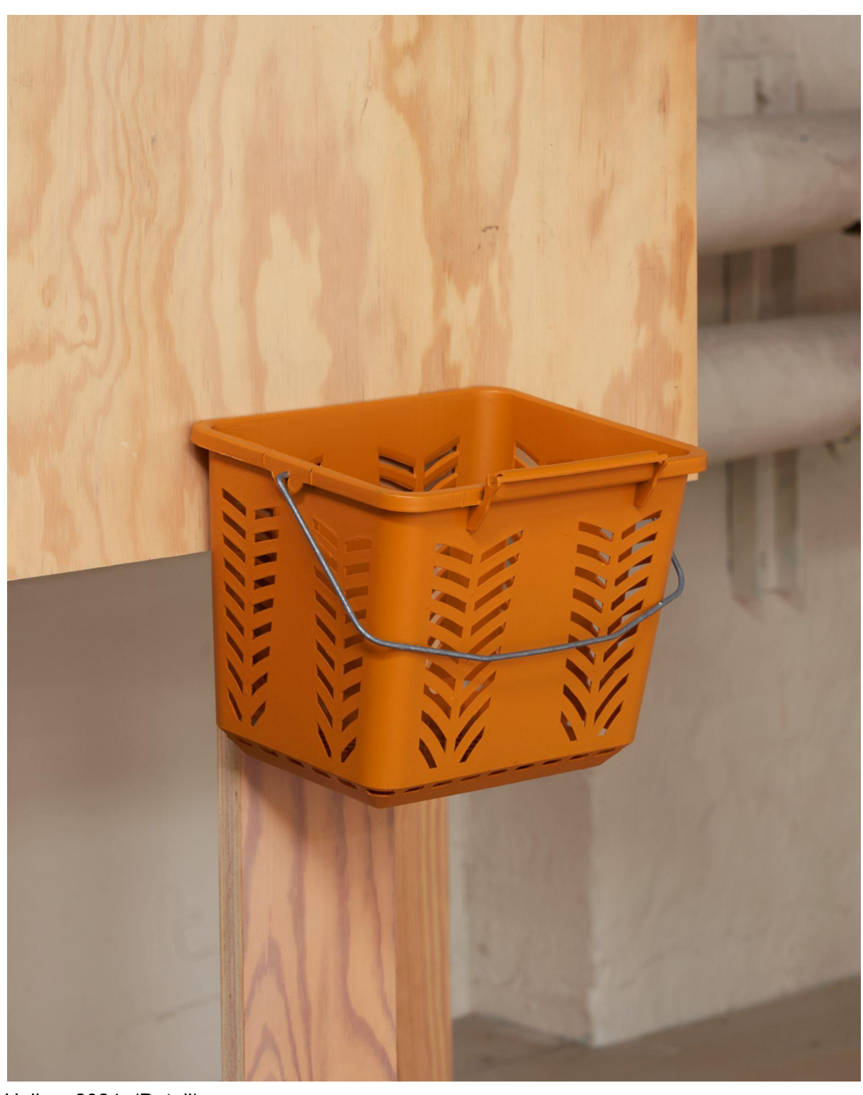
Hallen, 2024. (Detail)